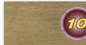
Madison Oak - Single Plank LCF30