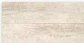
Antique White AQAW2V