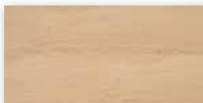
Natural Oak AQNO4V

If you are looking for a floor with authentic designs, a perfect quality and simplicity in installation and care, then laminate flooring is your best option.