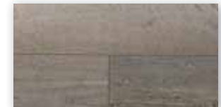
Country Oak Grey Oiled LFB 023