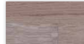
Country Oak - 2 strip LIF207