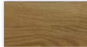
Walnut - 2 Strip LCF007