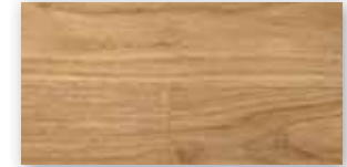
Natural Varnished Oak Planks LFB 019