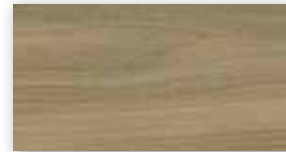
Vintage Oak - Single Plank LCF026