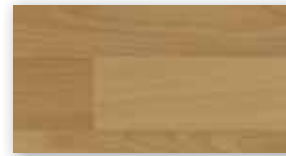
Enhanced Beech - 3 Strip LCF001