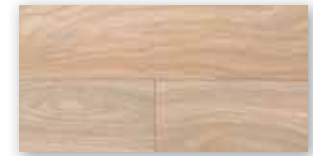
White Varnished Oak Planks LFB 018