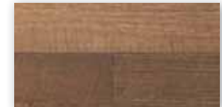
Country Oak Natural Varnished LFB 022