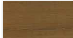
Cherry Verona - Single Plank LCF029