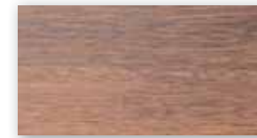
Merbau - 2 strip LIF102