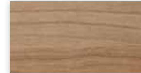
Wild Cherry - 2 strip LIF178