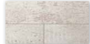
Heritage Oak LFB 021