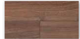
Planked Walnut LFB 020