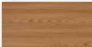
Kember Teak AQTK4V