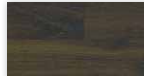
African Oak - 2 Strip LCF028