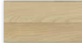
Enhanced Maple - 3 Strip LCF005